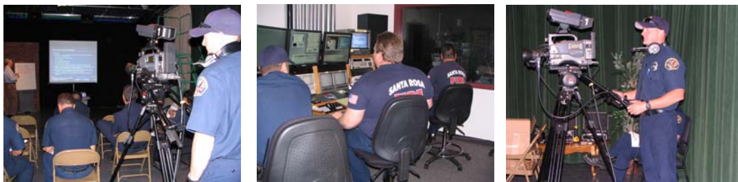
ABOVE: SRFD creating a live production in the CMC studio!!

The Santa Rosa Fire Department were active here in the CMC studio for several days last week creating their own live broadcast production! The production provided live training to firefighters across the city on how to handle wild land fires.